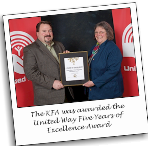
The KFA was awarded the United Way Five Years of Excellence Award